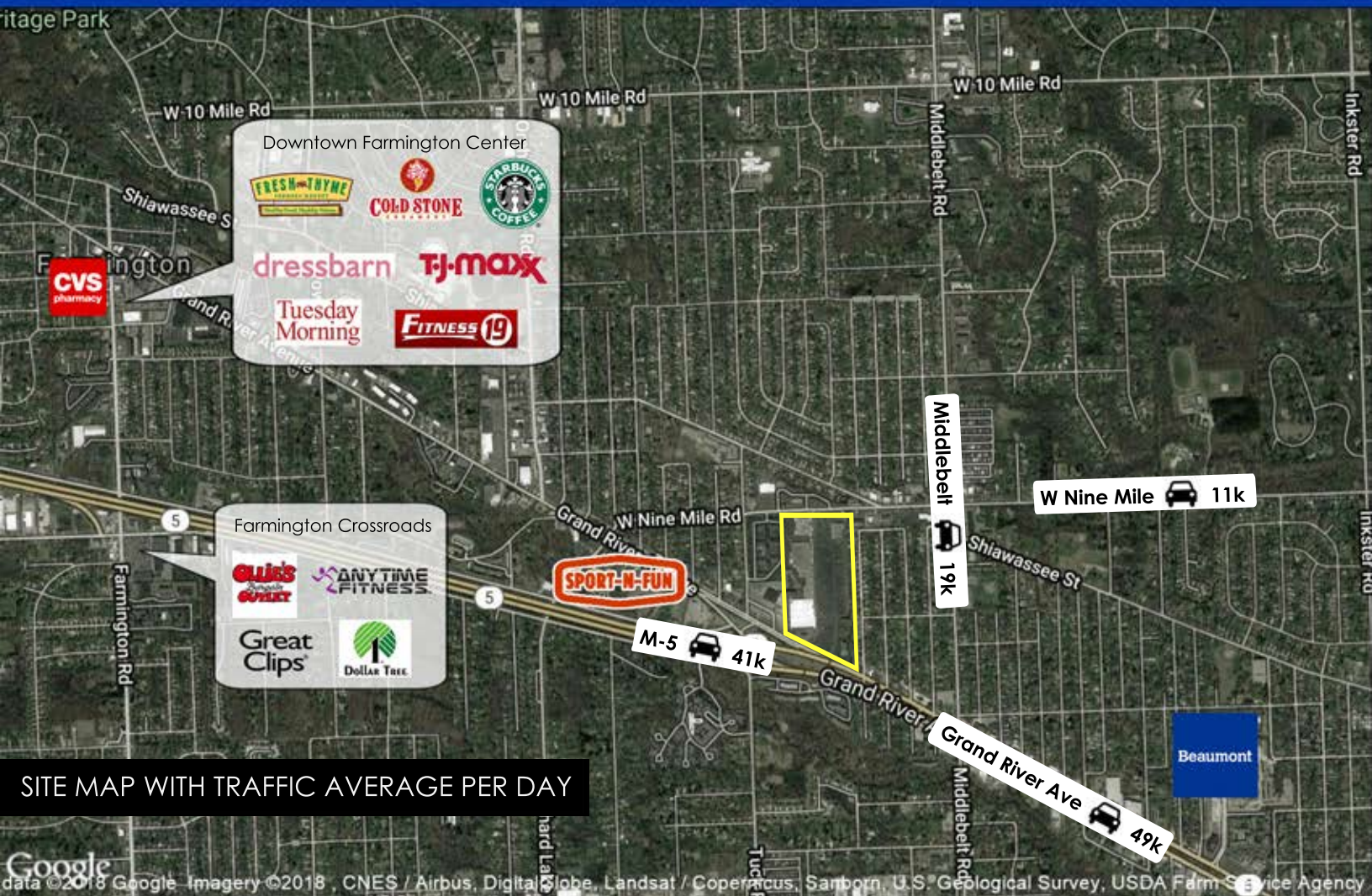
SITE MAP WITH TRAFFIC AVERAGE PER DAY

30000-30180 Grand River Ave, Farmington Hills, MI 48336